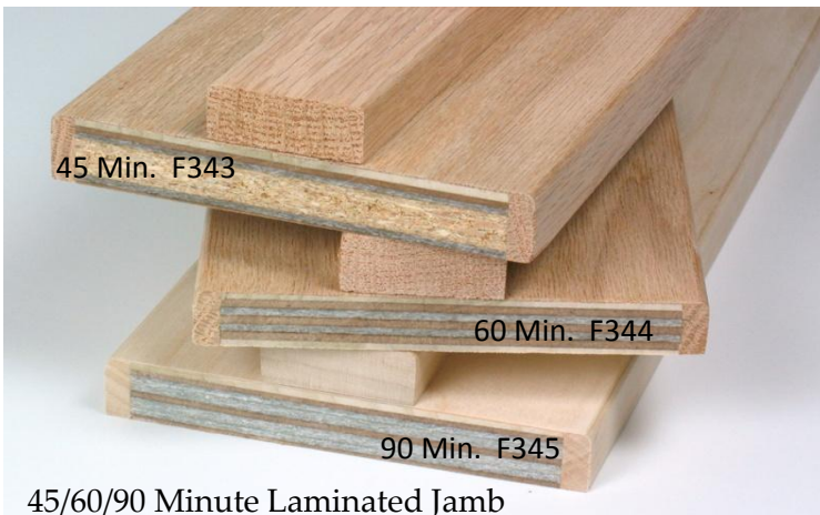
45/60/90 Minute Laminated Jamb

A positive pressure frame with a Category "B" door is a positive pressure opening.