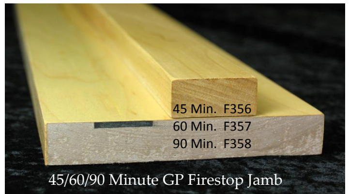
45/60/90 Minute GP Firestop Jamb

45, 60 and 90 minute jamb are manufactured by Ferche using one of two core materials.