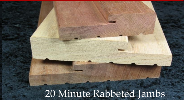
20 Minute Rabbeted Jamb